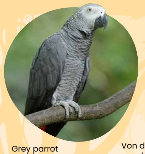
Von der Decken's hornbill

Birds can be found in different parts of a forest. Can you spot these birds in Heart of Africa?