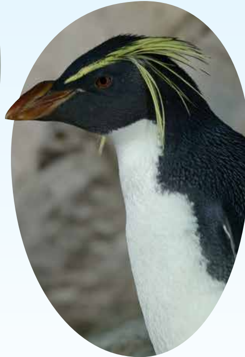
Northern rockhopper penguin