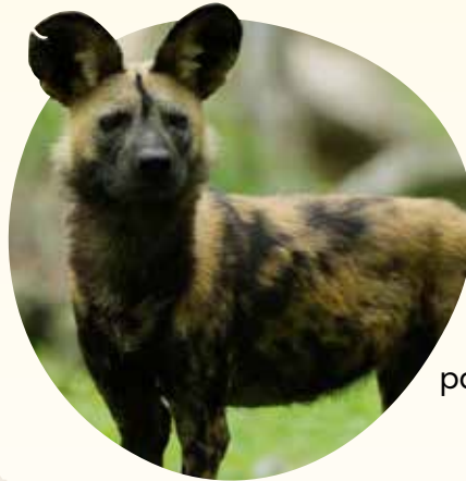
African painted dog